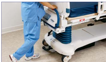
Optional Zoom® drive system minimizes the effort needed for patient transport while encouraging proper ergonomic posture.

The complexity and rising expense of treating critical patients necessitates a practical solution to providing quality care while driving down associated costs. To help address this challenge, Stryker designed a critical care platform that intuitively and efficiently facilitates and complements clinicians' care for their patients.